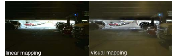
Figure 2. Tone-mapping of a high dynamic range image with a 10,000-to-1 intensity range. Linear mapping (left) clips the range and loses detail. The visual mapping (right) compresses the intensity range and accurately represents the scene's true appearance.

One example is tone mapping algorithms that compress high dynamic range images for display on low dynamic range devices [2,3,4,6,7]. Because the algorithms are based on advanced models of human vision they produce images that are faithful visual representations of scene appearance. Figure 2 shows one of these algorithms applied to a high dynamic range image of an outdoor scene.