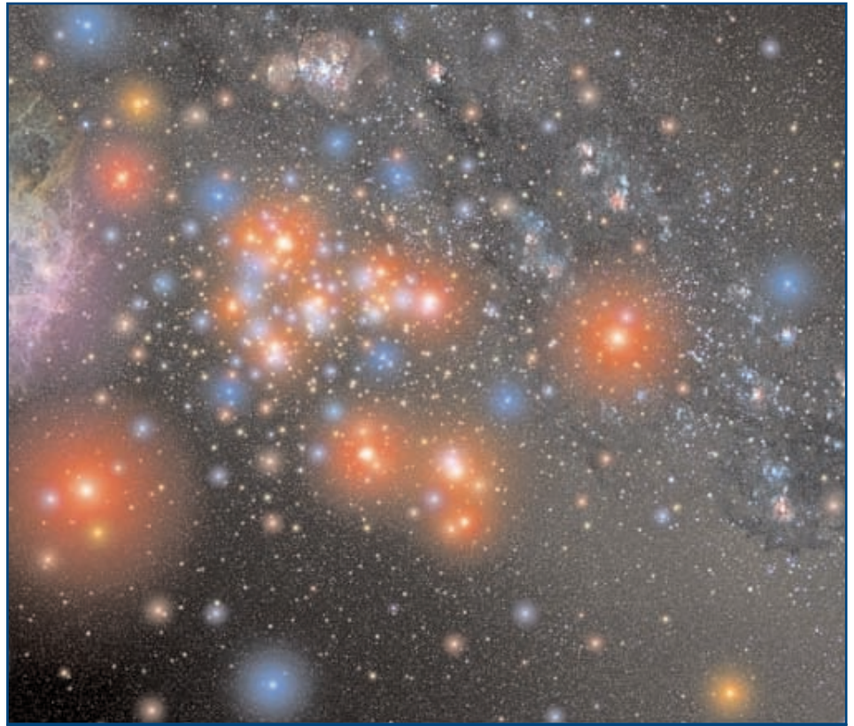
Artist's View of Massive Star Cluster in the Milky Way NASA, ESA, and A. Schaller • STScI-PRC06-03b

“But that’s probably not true because we’re starting to see more massive clusters,” Figer notes, adding