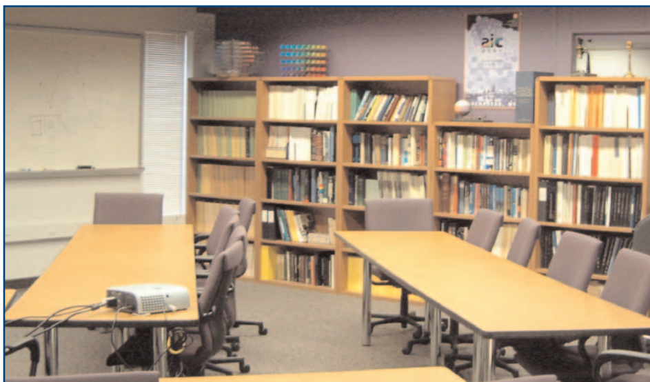
Franc Grum Color Science Learning Center shown above with more improvements to come in preparation of the Grand Opening and Dedication Ceremony May 10.

A fund-raising effort, initiated through a grant from the Xerox Foundation, recently raised over $100,000 to support the Franc Grum Center. While the initial fund-raising