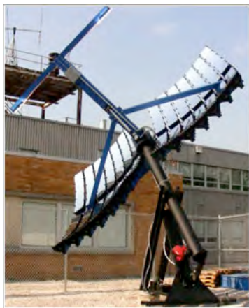
Solar Concentrator System Green Field Solar, Cleveland, OH 5kW, Roof Top (800-1000X)

Assistant Professor, Physics Rochester Institute of Technology